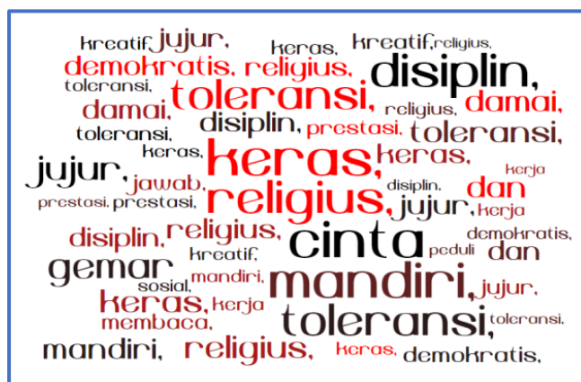
Figure 1. Wordcloud Character Values in Tapak Suci

on the dominant character in each interview with research informants.