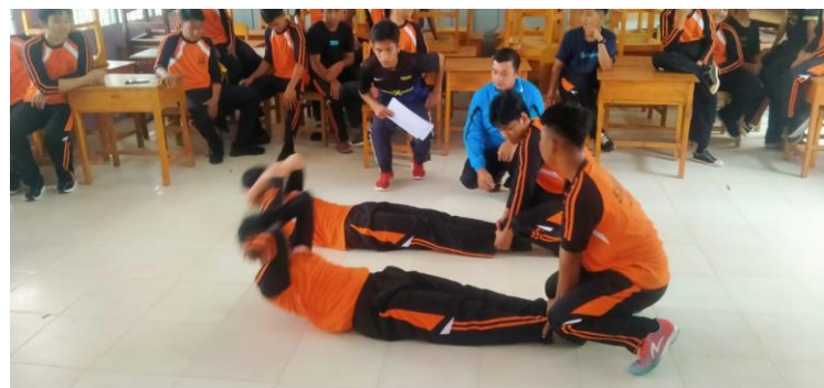
Gambar 10. Sit Up