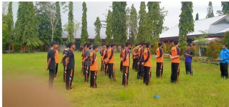
Gambar 2. Pemberian Arahan Dari Peneliti