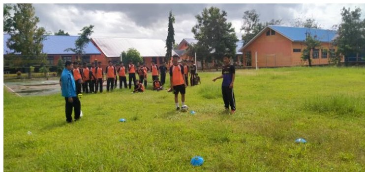
Gambar 13. Menggiring Bola