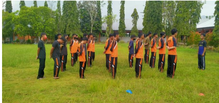
Gambar 1. Pemberian Arahan Dari Peneliti