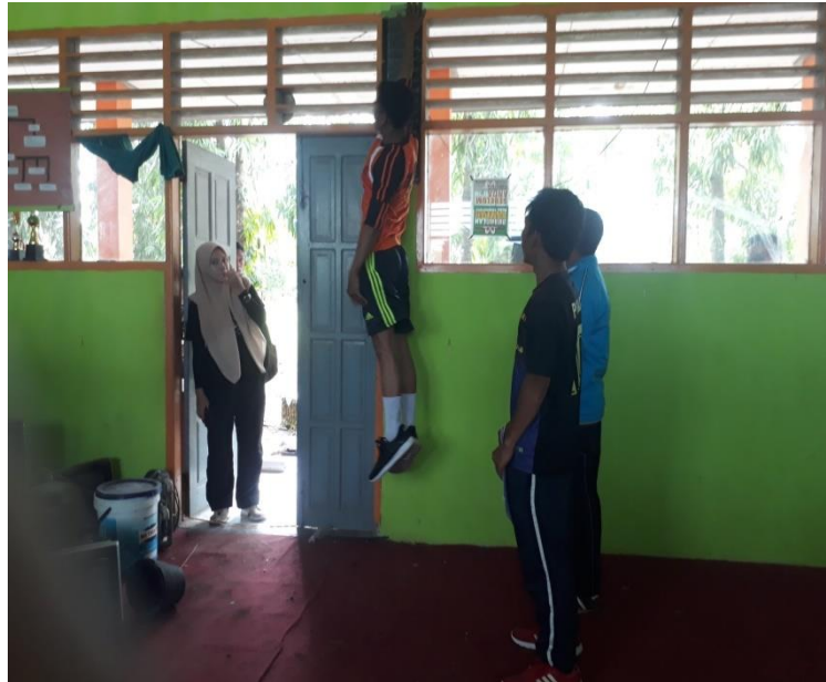
Gambar 9. Vertical Jump