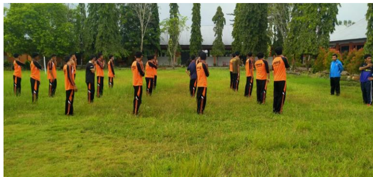
Gambar 5. Pemanasan