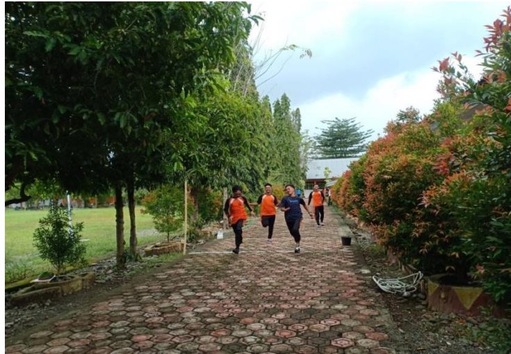
Gambar 7. Lari 60 Meter