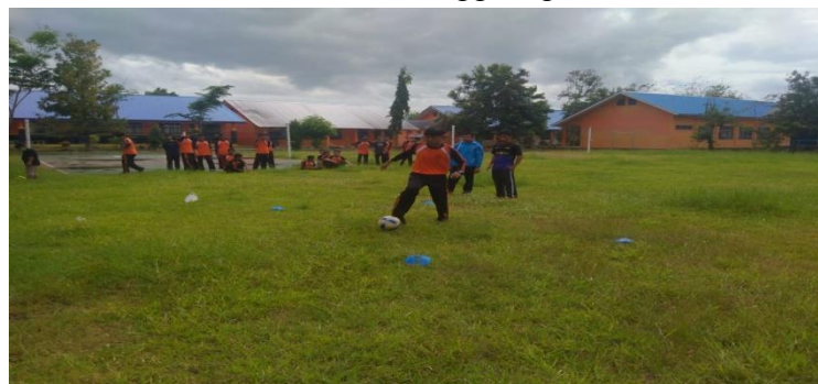
Gambar 15. Menggiring Bola