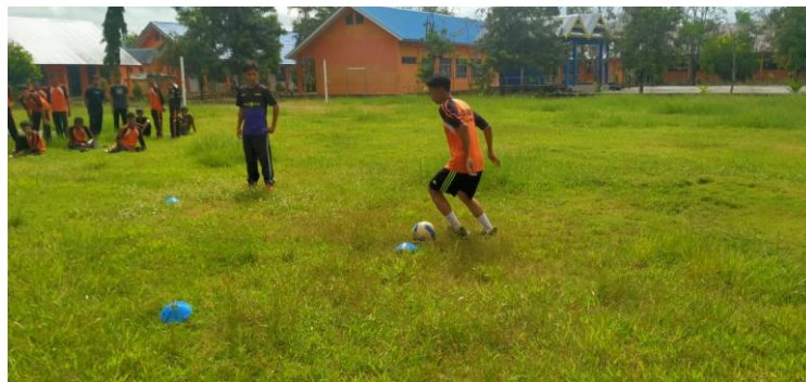
Gambar 14. Menggiring Bola