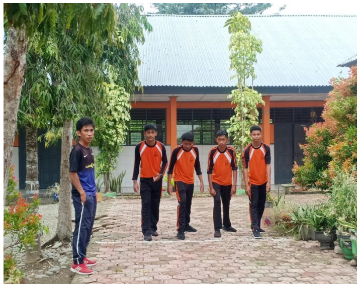
Gambar 6. Lari 60 Meter