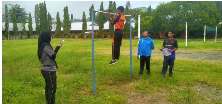
Gambar 8.Pull Up