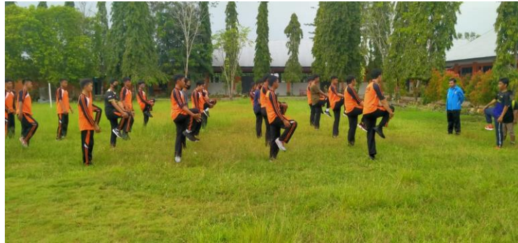
Gambar 4. Pemanasan