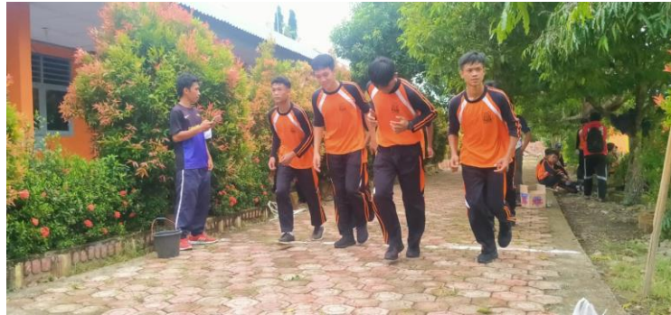
Gambar 12. Lari 1200 meter