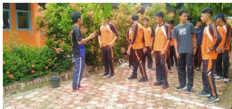
Gambar 11. Lari 1200 meter