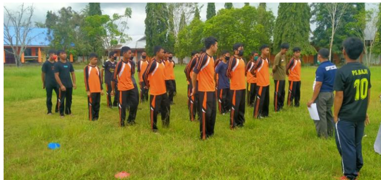
Gambar 2. Pemberian Arahan Dari Peneliti