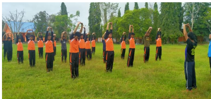
Gambar 3. Pemanasan