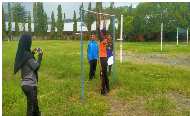
Gambar 8.Pull Up